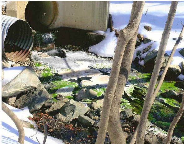
Photo taken on a Crum Creek tributary in winter showing showing detergent discharge from stormwater outfall and algae in the stream.

Stormdrains convey the polluted water directly to our local streams untreated.